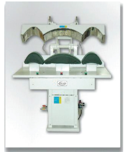
QYC-207 Collar & Cuff Press