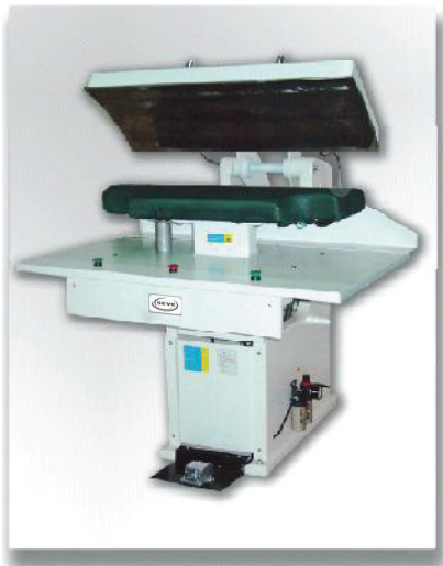
QYC-204 Body Press